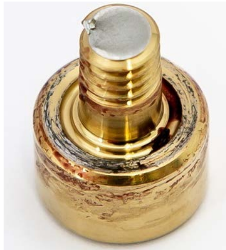
Fig.3: Torsion fracture of screw M6

Aim is to analyse the differences of fracture of the screw M6 (Fig. 3) in different settings (series 1-4). Due to the small sample numbers we selected Fisher's exact test for statistical analysis [23, 24]. Since there is the reasonable assumption that cleaning the interface reduces the probability of screw cracks, we use the one-sided variant of the test.