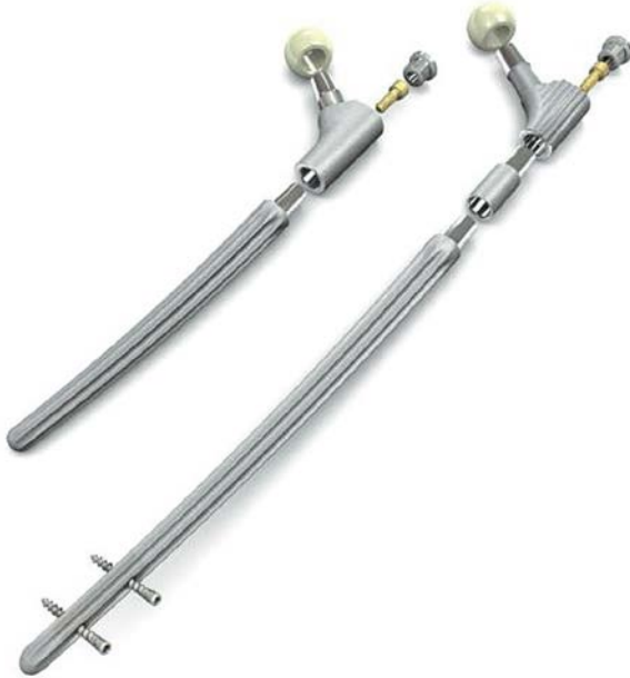
Fig. 1: The MRP-TITAN System with the lockingscrew (gold)

– An optional extension sleeve, adding 30 mm to the neck length. The continuously adjustable taper connections are locked intraoperatively with a titanium-nitride coated locking screw using an implant-specific torque wrench 25 Nm.